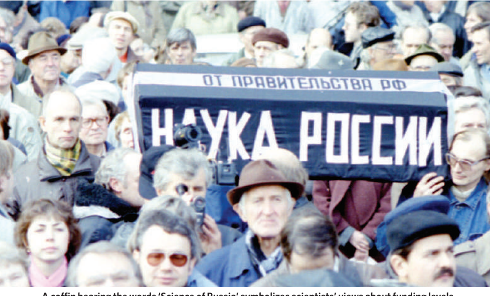
A coffin bearing the words 'Science of Russia' symbolizes scientists' views about funding levels.

The academy leadership, backed by most of the full and corresponding academicians who make up the general assembly, vehemently opposes the new law and subsequent charter. It has prepared its own charter, which is currently being reviewed by the government, in which the academy would remain a self-governed organization, free to allocate funds independently, and with the right to set up, modify or liquidate institutes as it sees fit.